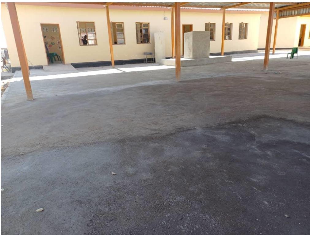
The finished flooring of the school shelter.

At the time of writing, the handover ceremony had just taken place, so do look out on TCT's social media channels for coverage of the event.