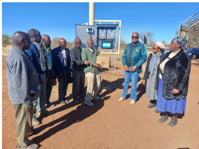
Handover ceremony of the new lithium battery