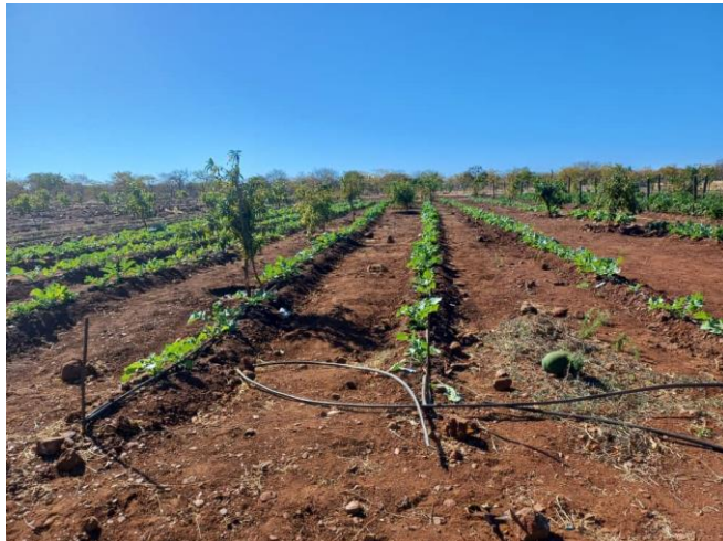
Healthy crops growing successfully, and fully protected from wildlife

The next phase of the project is the provision of a sustainable watering system, followed in the longer term by horticultural training, to increase the crop yield, followed by a feasibility study to be undertaken to evaluate the scalability of the project across the other communities neighbouring Notugre.